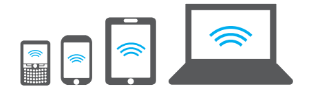
Multiple users - Multiple devices

The Shark X4 is the highest power 53db gain Marine Amplifier on the market. It will keep you connected where other amplifiers fail. It amplifies signal to all mobile phones and mobile devices within the Amplifier's range simultaneously. This is a wireless amplifier that does not require a physical connection to the mobile phone or mobile data device. The Smoothtalker Marine X4 Extreme Power Amplifier is the most technologically advanced wireless mobile signal amplifier made. It features proprietary "stealth tech technology" that prevents shutdowns from poor antenna placement and changing environment. This amplifier has 53dB of gain and provides coverage throughout your vessel. The Shark X4 can keep you connected up to 50km from the nearest tower.