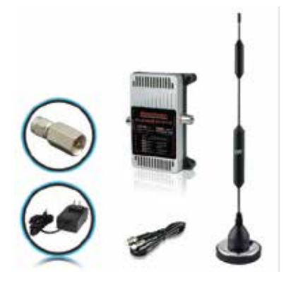
Stealth M2M X4 Parts Included (Power supply and antenna may vary depending on Kit purchased)

Important: Use only the power supply included with the amplifier. Connecting any other power supply at any time will result in damage to the amplifier and will void the warranty. Do not turn on the power switch until ALL cables have been screwed or plugged into the amplifier or you can cause damage to the amplifier.