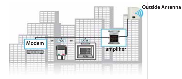
Typical Installation Stealth M2M X4 (Fig. 3)

If you need help pls contact techsupport@smoothtalker.com and we will help you determine your cell tower location and get you setup.